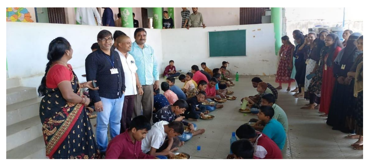
Ghatkesar/Coordinates 17.4511° N, 78.6810° E