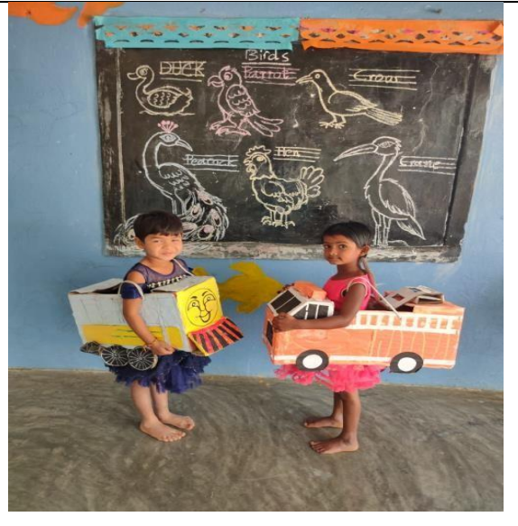
Edulabad ZPHS ,Ghatkeswar Latitude: 17.424 Longitude: 78.6952