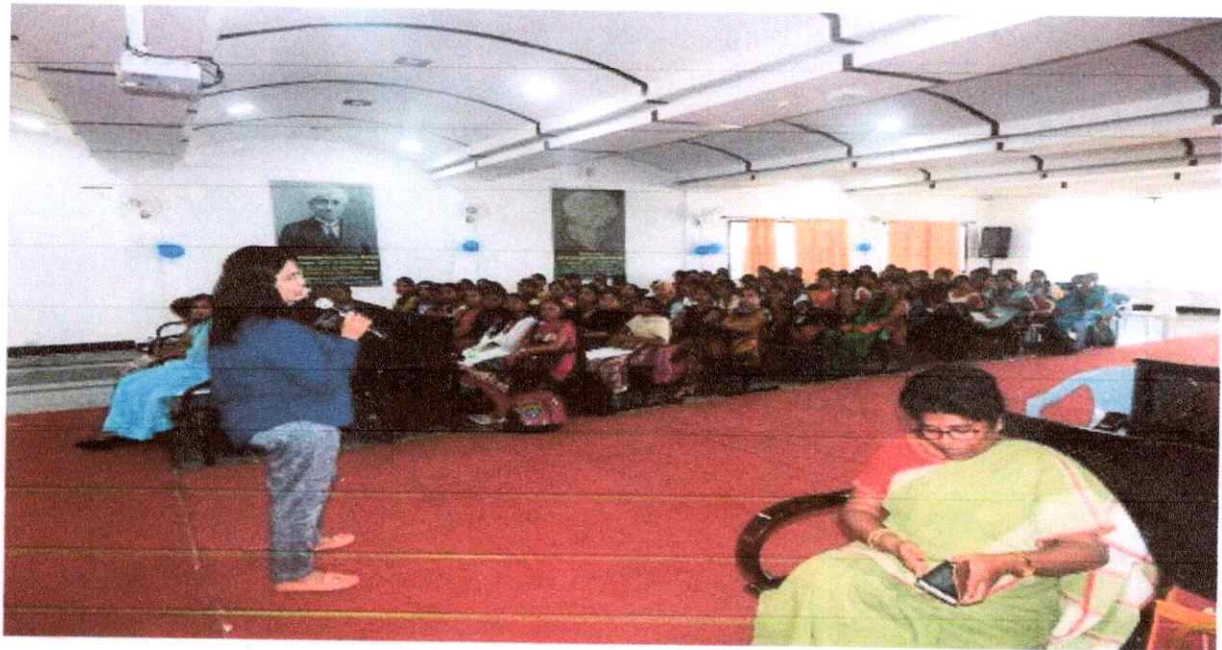
Lecture on career planning by experts