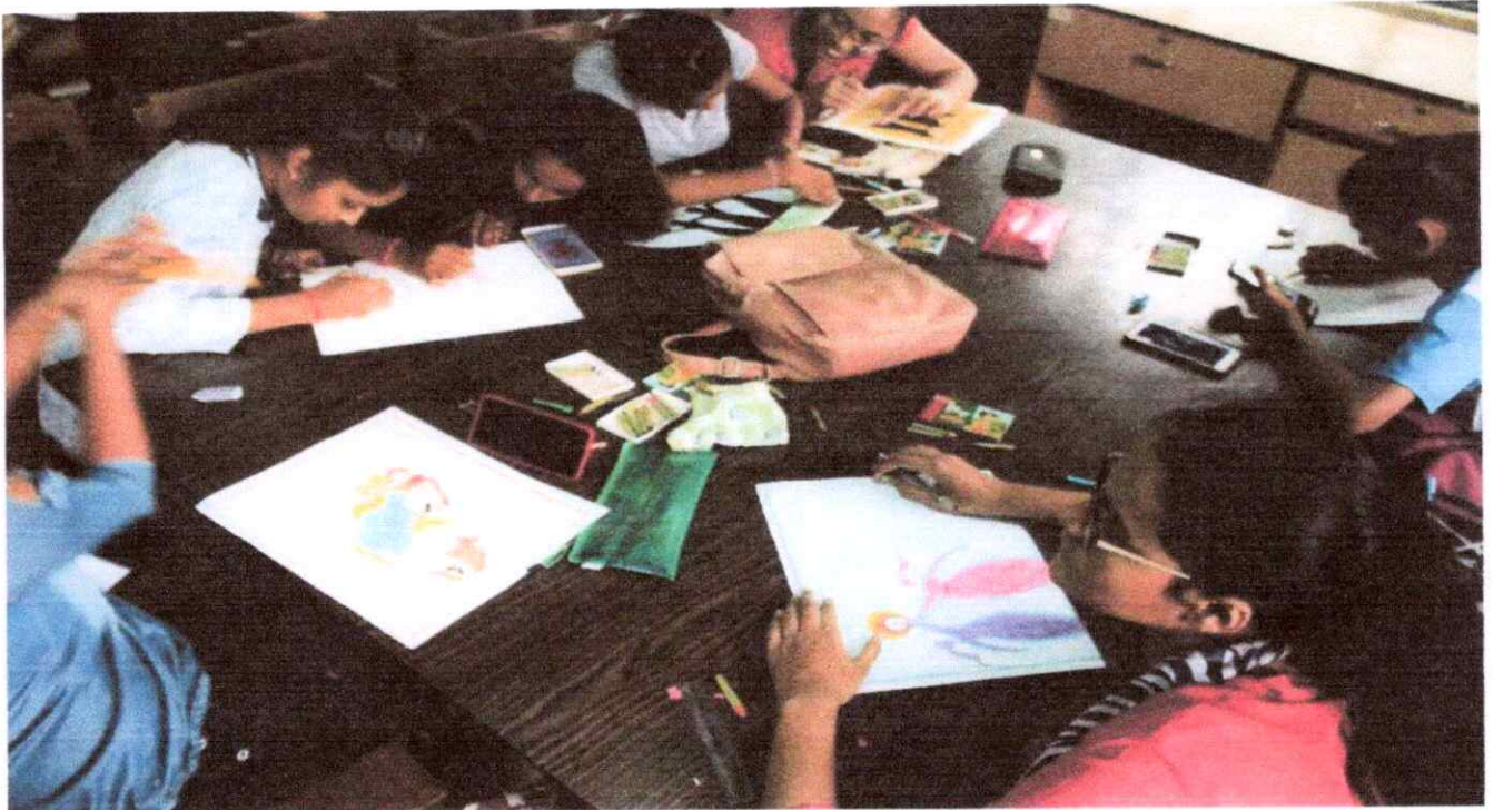
Creative art and Painting Session