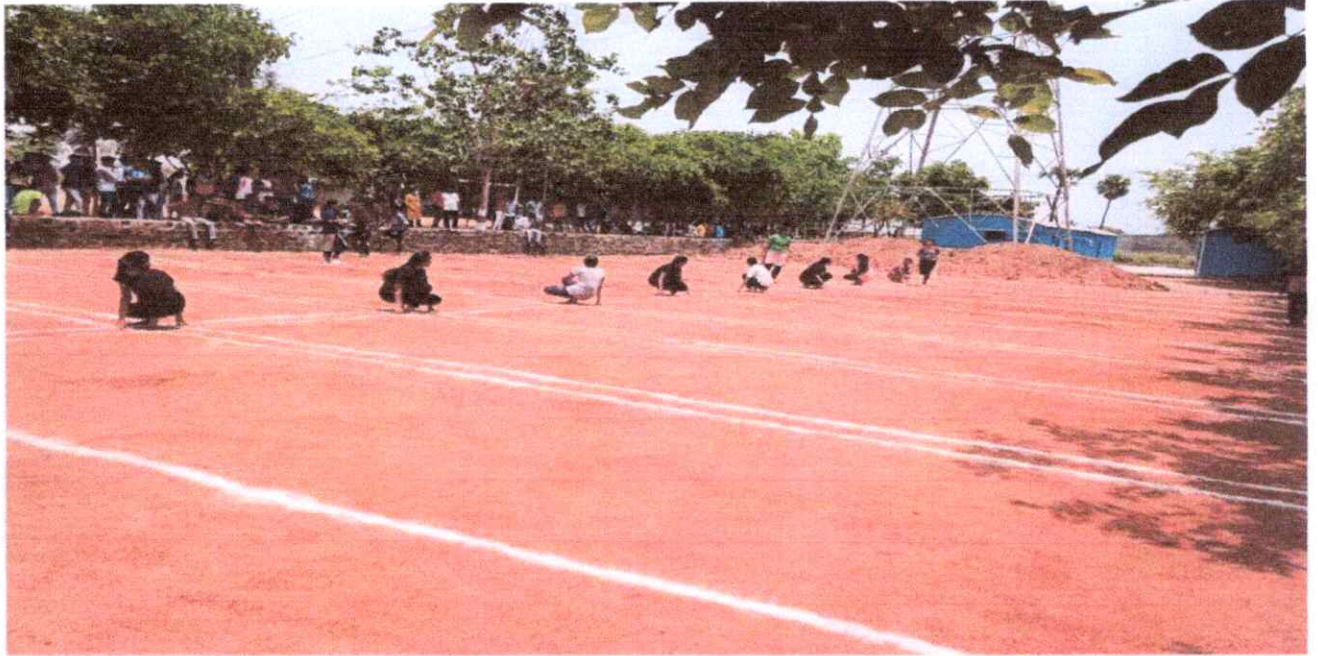
Student's participation in outdoor games