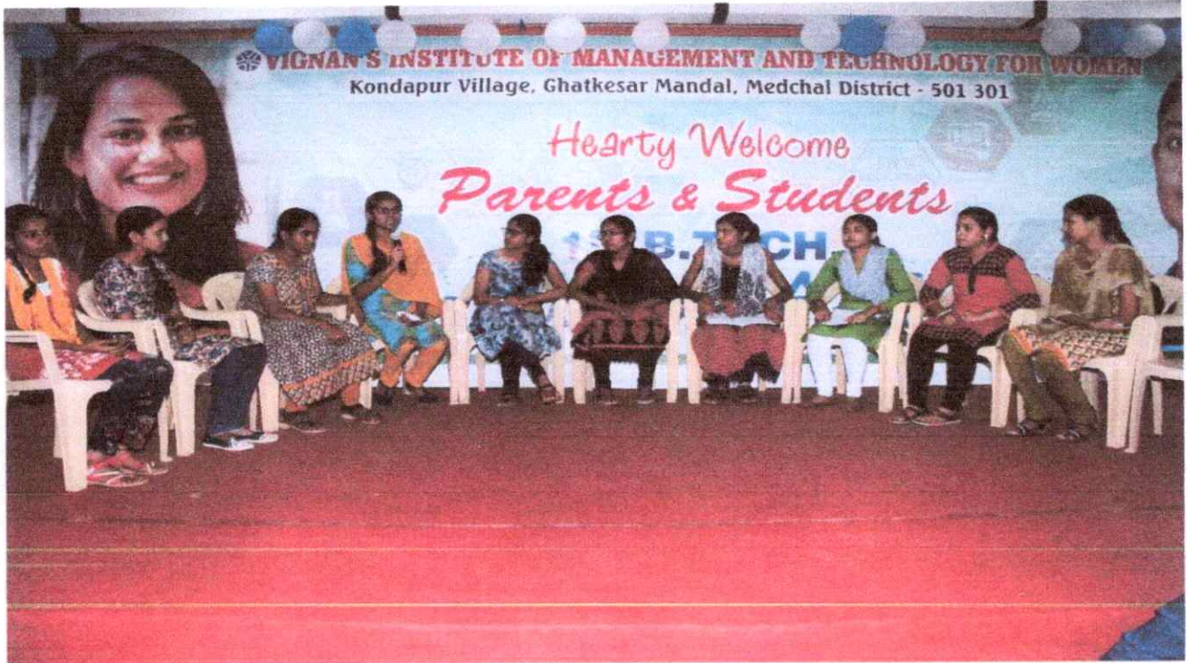
Students participation in debate