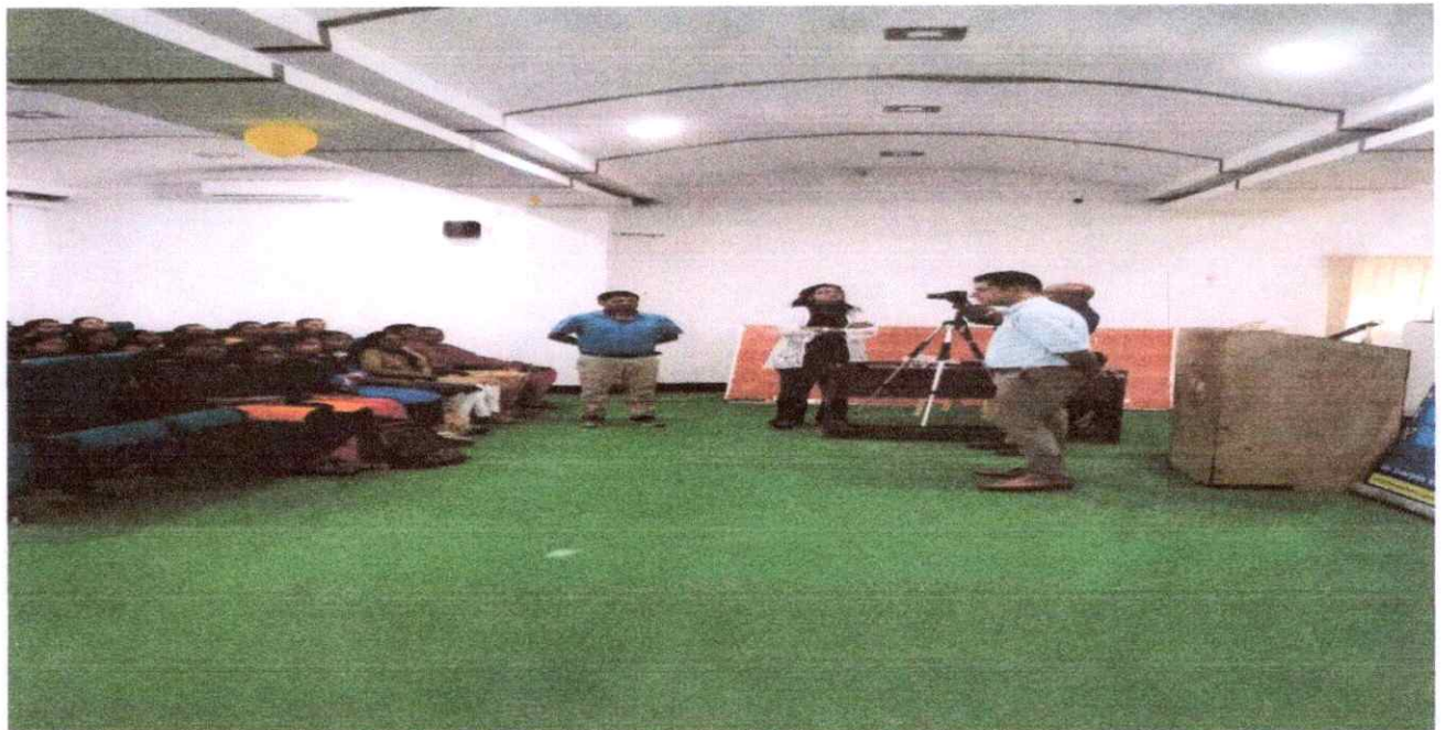
Lecture on Human Values and career planning by experts