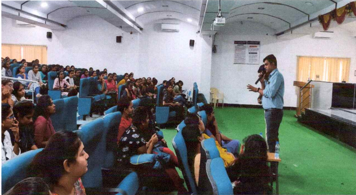
Student's participation in soft skills and life skills program session