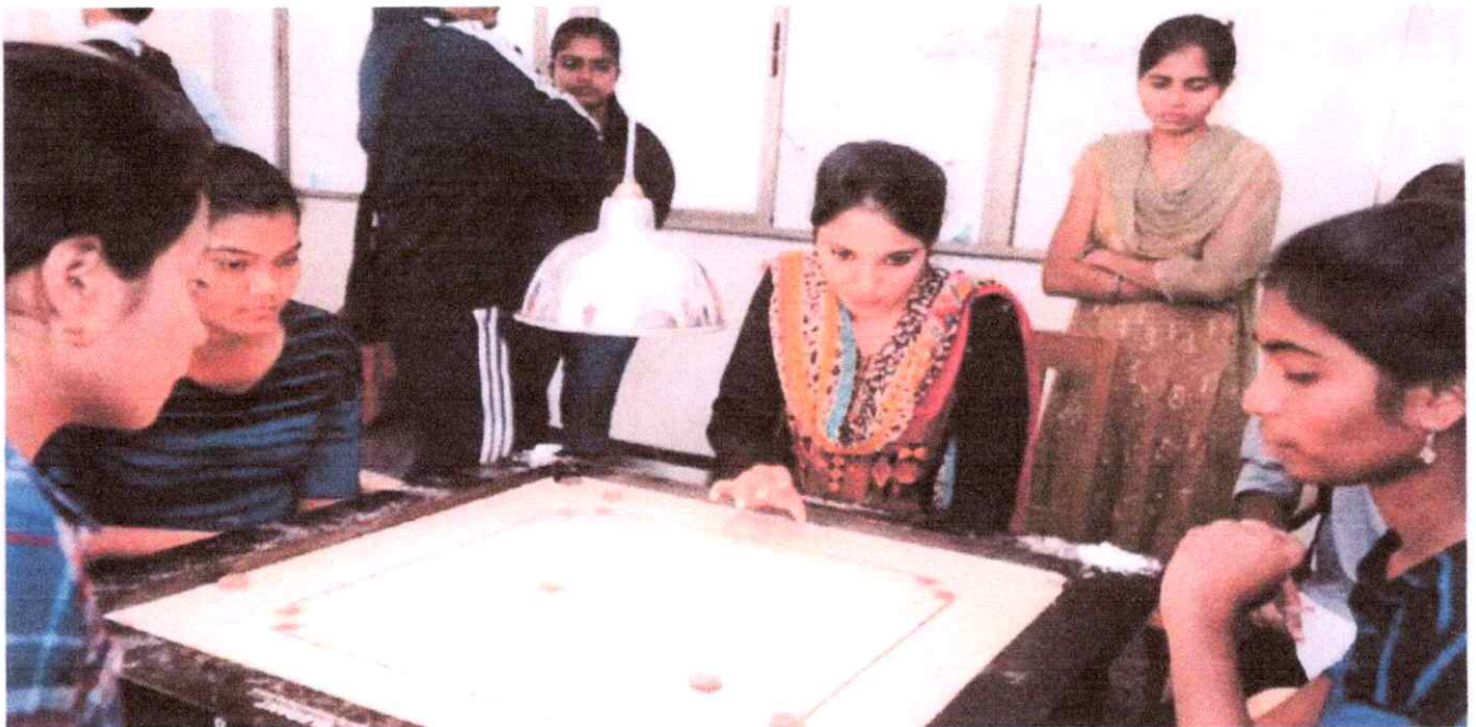
Student's participation in indoor games